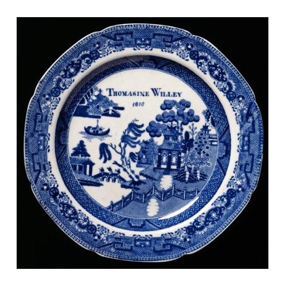
Figure 2: Willow Pattern Plate, 19th century, Staffordshire, England. Held in the Victoria and Albert Museum, London, England.

In the end, as we consider Judge Dee's world, which Robert van Gulik recreated, it is not so very different from the one we now live in. The past and the present share many of the same concerns: law and order, social justice, family unity. Similarly, the East and West are not very far apart. Certainly, there are cultural differences and language barriers that separate the two, but van Gulik may have given us clues for overcoming these obstacles. Many of these are epitomized in Judge Dee's character. Van Gulik must have recognized an extraordinary potential in Judge Dee to have turned so much of his attention toward authoring such fictional accounts. Toward the end of his life, van Gulik confessed that writing Judge Dee represented an important part of his work; the reason why, he suggested, is "while writing his novels an author is free to create his own facts and can fanaticize as much as he pleases." There is merit to this kind of work, not only for what it reflects in terms of what has been accomplished, but also for what it aspires to in terms of expectations. In this regard, van Gulik was Judge Dee.