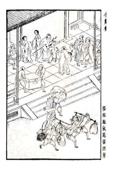
Figure 2. "Ms. Yang Angrily Blamed Fourth Uncle Zhang the Fourth"; rpt. in Jin Ping Mei xinke xiuxiang piping (Hong Kong: Joint Publishing, 2011), Chapter 7.

In Jin Ping Mei illustrations, keeping the size of human figures small in relation to the frame is important for several practical reasons. First, this gives the designer enough room to include multiple characters in a picture. Take, for example, figures 1 and 2 – while the former features six characters, the latter contains sixteen human figures. 98 Second, keeping the human figures small in relation to their environment allows the designer to present multiple spaces within each picture. Again, both figure 1 and figure 2 serve as good examples. Figure 1 features several actions, each of which takes place in a specific space: while the central event, i.e. Wu Song wreaking havoc in a wine shop by beating up a rascal takes place on the second floor of the building, the rest of the space is divided into two main areas - the "back" area where an escaping Ximen Qing gains an unexpected glimpse of a woman "doing her business" in a toilet, and the "front" area, the first floor of the wine shop building where an employee looks concerned with the disturbance upstairs. The division of the picture into smaller spaces representing everyday locations also serves as an important means to contextualize events and create realism. Moreover, the small scale of human figures leaves room for introducing into the pictures complex interactions between depicted characters, as can be seen in both figures 1 and 2.