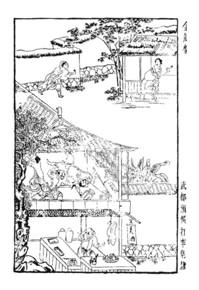
Figure 1. "Wu Song Beat up the Wrong Man"; rpt. in Jin Ping Mei xinke xiuxiang piping (Hong Kong: Joint Publishing, 2011), Chapter 9.