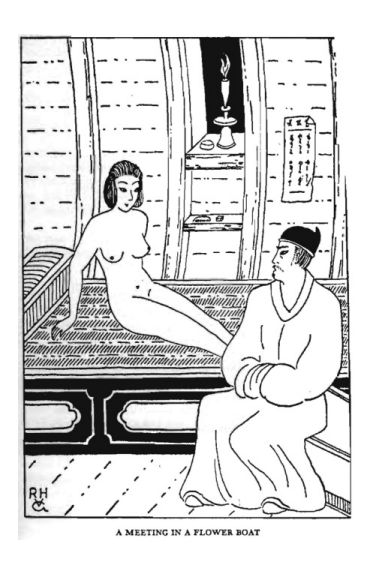
Figure 6. From Robert Hans van Gulik, The Chinese Gold Murders (New York: Harper, 2004) 55.