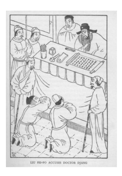
Figure 1: A van Gulik Sketch of Judge Dee from The Chinese Lake Murders